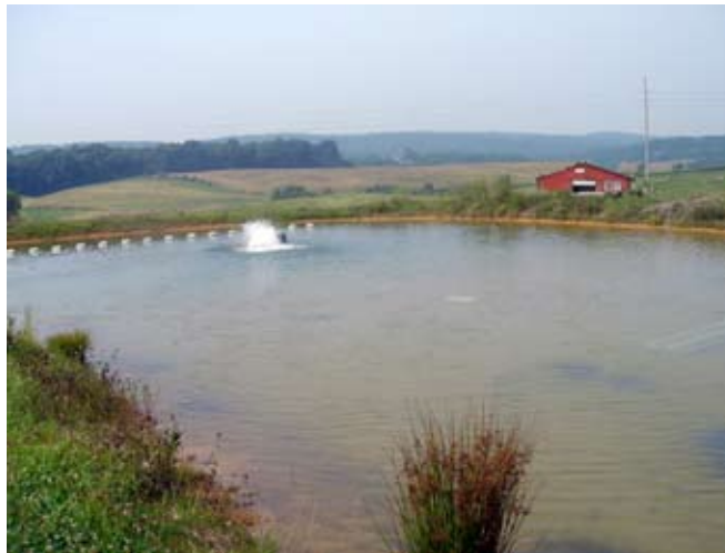
A typical pond at an aquaculture facility receiving oxygenation through a paddle wheel. As energy costs rise, make sure you can accurately determine when to aerate and when it's unnecessary.

exacerbated in aquaculture systems with high stocking densities. See Graph 1 for an average pond's DO diurnal cycle.