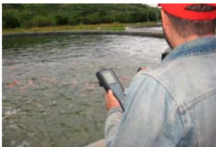
Manually checking a pond with the YSI Professional Plus.

In summer months, ponds can undergo stratification because of differences in water densities with differing temperatures. Cooler water sinks, warmer water rises, and the water at the top of the pond is heated more rapidly through radiation by the sun. Although the pond's cooler bottom temperature holds more dissolved oxygen when the summer starts, as the summer progresses microbial decomposition of organic materials depletes oxygen at the pond's bottom.