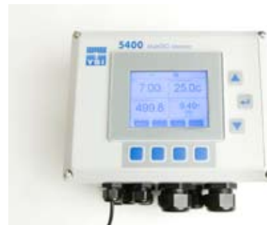
YSI 5400 multi-dissolved oxygen instrument with control and alarming capabilities.

For additional information please contact YSI Tel. +1 937 767 7241 US 800 897 4151 Fax +1 937 767 9353 Email. aquaculture@ysi.com Web. www.ysi.com/aquaculture